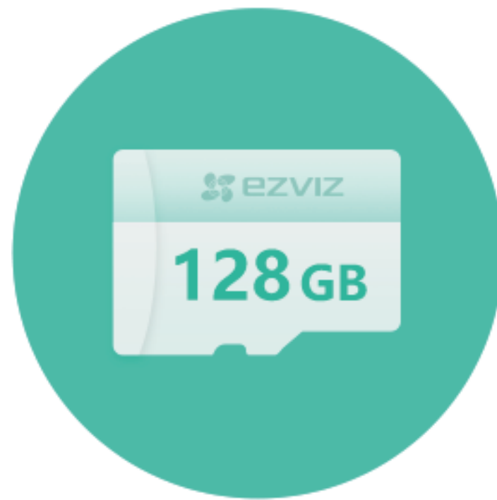
Supports MicroSD Card

Save your recordings with flexible and secured solutions. The Outdoor Floodlight comes with a built-in MicroSD card slot that can store up to 128 GB recorded footage. You can also save your images to EZVIZ Cloud for Additional back-up. (EZVIZ cloud storage service is only available in the US,UK and Europe.)