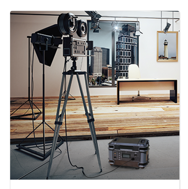
Power your creative filming projects