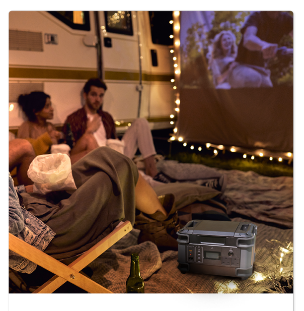
Enjoy off-the-grid recreational activities