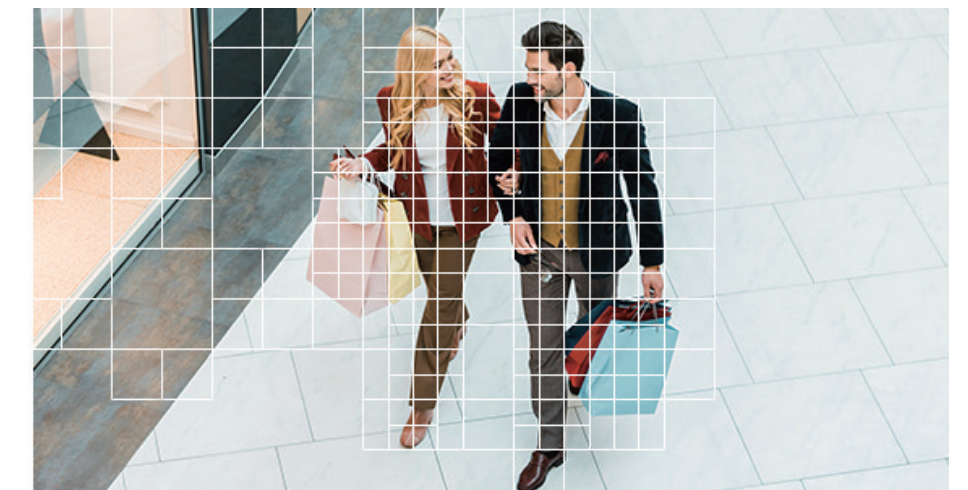
H.265 (Upgraded Video Compression)