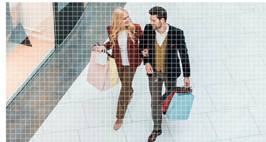
H.264 (Mainstream Video Compression)

The X5S-16H NVR uses the efficient H.265 video compression technology to provide smoother live streaming and smaller files with uncompromised video quality.